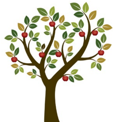
Graphic: © rolandtopor

How could you make your roots deeper and stronger?